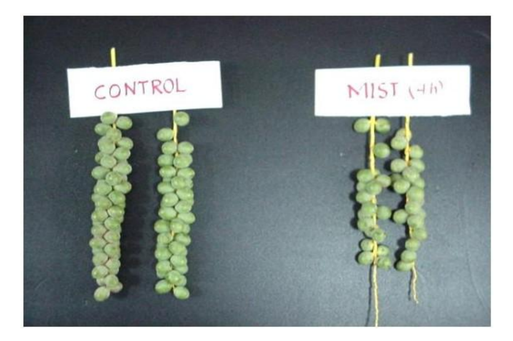
Fig.1. A photograph of Lulu strands taken early at the Hababouk stage showing the effect of simulated rain after 4 hrs of pollination on fruit set as compared with the control (no rain).